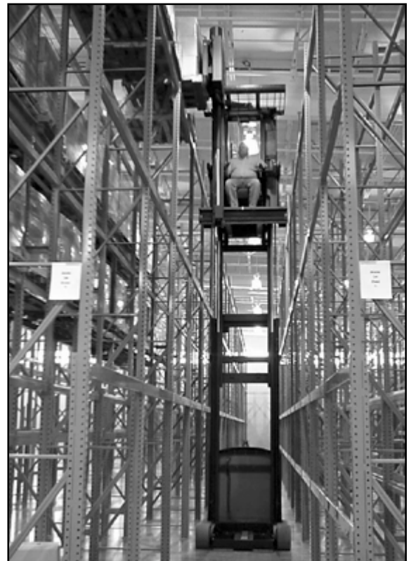
The overhead doors and receiving area of the new warehouse are shown above. The new lift if pictured in the photo at right.